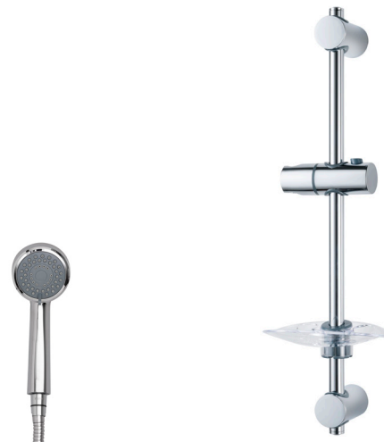
Lara Multi Spray Shower Head TSHMLAR3POSCH