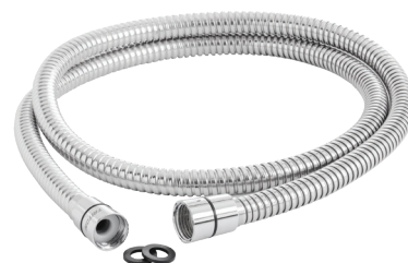
1.25m Anti-twist Hose - Chrome TSHG1203